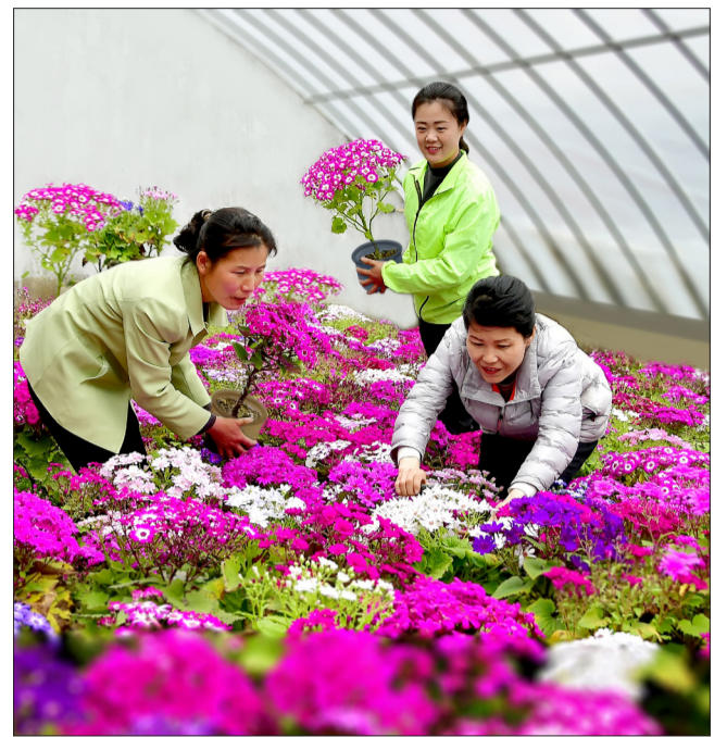
Employees grow beautiful flowers with great care at the Phyongchon District Floricultural Farm.

"Whenever people are happy to see full-blown flowers in streets, we feel pride in our work and we would start working with a light heart even though it was difficult," said Jang