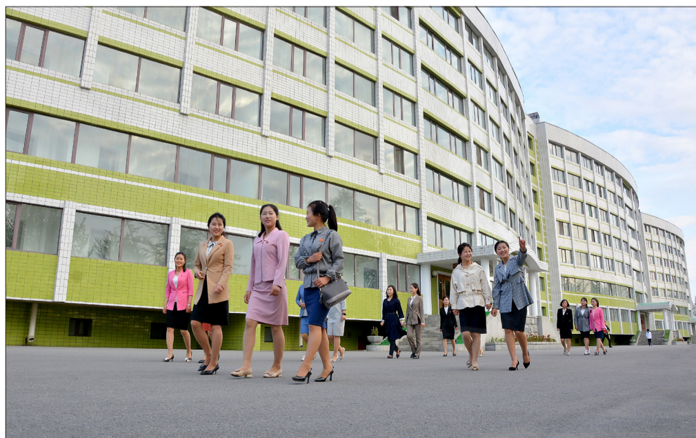
Girl workers live free from any inconvenience at the workers' hostel of the Pyongyang Kim Jong Suk Textile Mill.