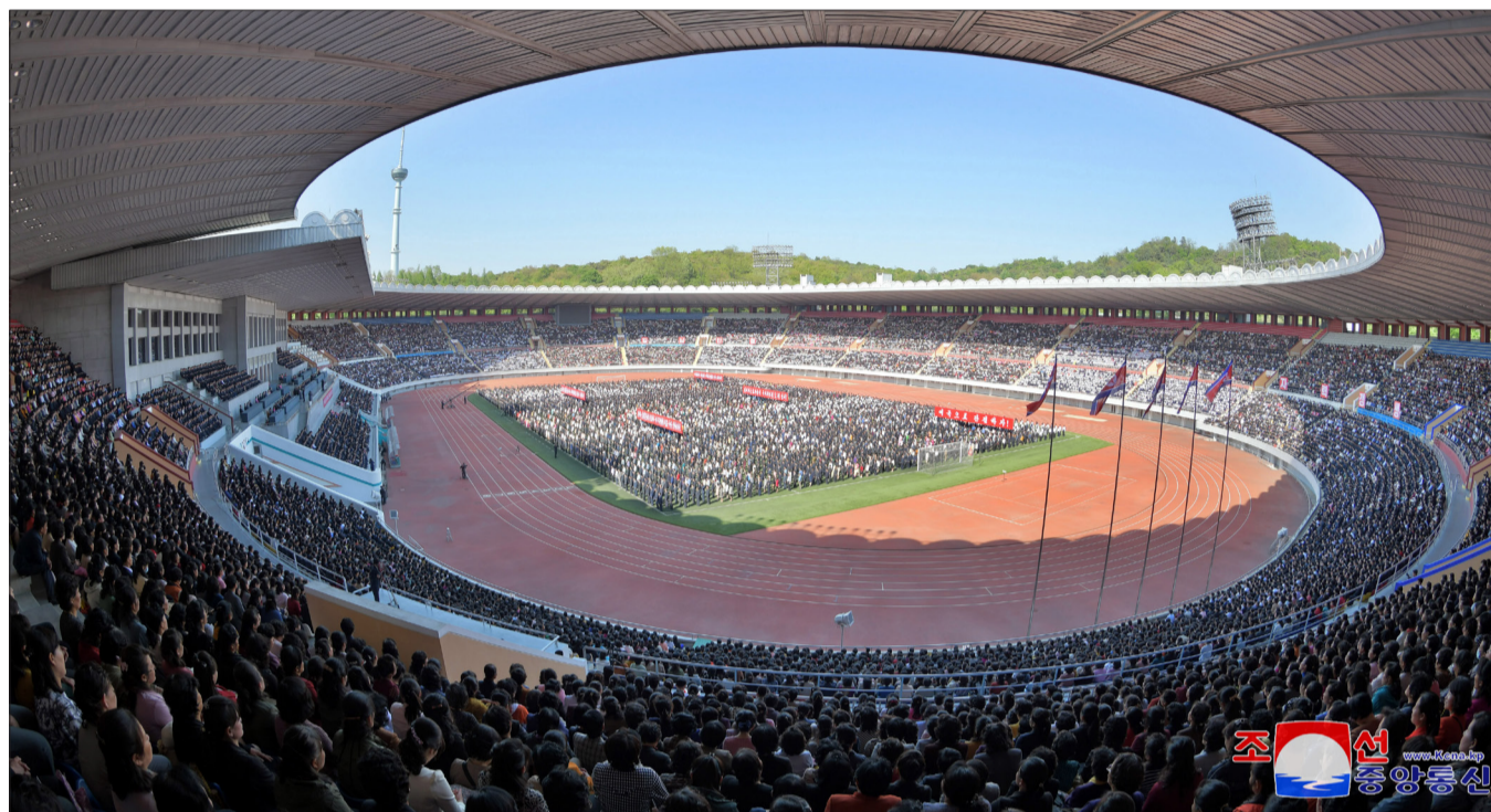
A national meeting takes place at Kim Il Sung Stadium on May 1 to mark the 134th May Day, the international holiday of working people all over the world.

The reporter said that the proud course of the working people of the DPRK, who have grown up to be masters of their destiny and dynamically advanced along the road of socialist construction under the guidance of the great leaders, holds the most brilliant place in the long history of struggle of working people of the