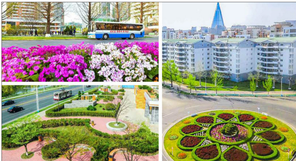
Pyongyang streets are decorated with beautiful flowers.