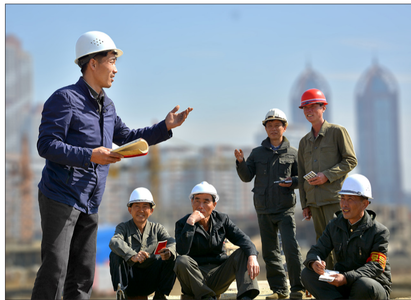
A builder recites his poem before others during a break.

The poems written by the builders add to enthusiasm for creation at the construction site.