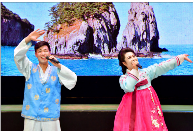
The National Acrobatic Troupe and the National Folk Art Troupe give a performance at the Pyongyang Circus Theatre.

floating swing, which can be claimed to be the climax of the work, the audience applauded enthusiastically as they were lost in admiration.