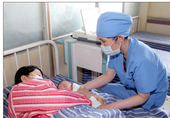
A midwife takes care of a nursing mother and newborn baby at the Pyongyang Maternity Hospital.

There are the Pyongyang Maternity Hospital that all the Korean women call "our parents' home" in Pyongyang