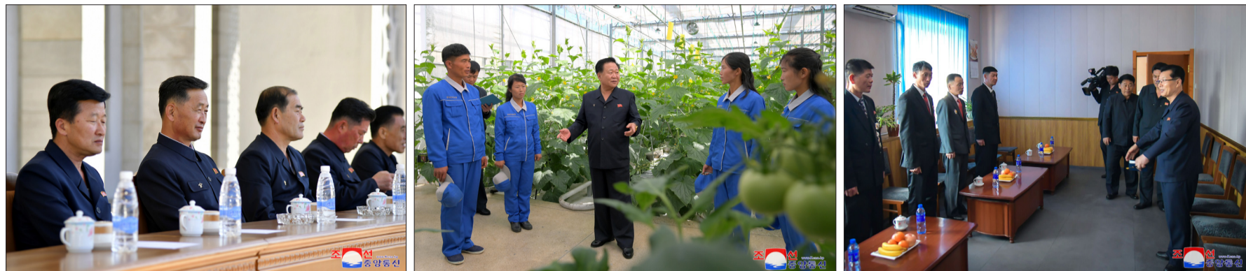
Senior officials of the Workers' Party of Korea and the government of the DPRK commemorate May Day together with working people at industrial establishments across the country.

KCNA All the people across the DPRK celebrated May Day, the international holiday of the working people all over the world. Senior officials of the Workers' Party of Korea and the government visited