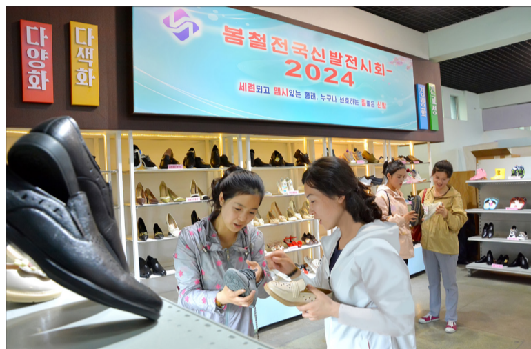
Visitors carefully choose shoes at the Spring National Footwear Exhibition-2024.

"It is the intention of our Party to radically improve the quality of shoes in the near future by digitizing and informatizing the footwear industry in the period of implementing the current five-year plan. Exhibitions are important occasions for hastening it," said Choe Sun Chol, section chief of the Ministry of Light Industry.