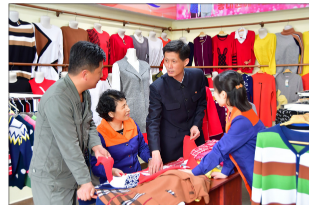
Officials and technicians discuss how to improve the quality of products at the Tongdaewon Aeguk Knitwear Factory.