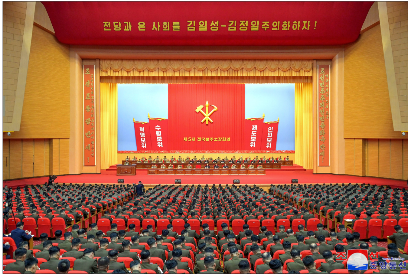
The Fifth National Conference of Heads of Branch Public Security Stations is held at the April 25 House of Culture from April 30 to May 1.

The reporter said that the respected Comrade Kim Jong Un clarified