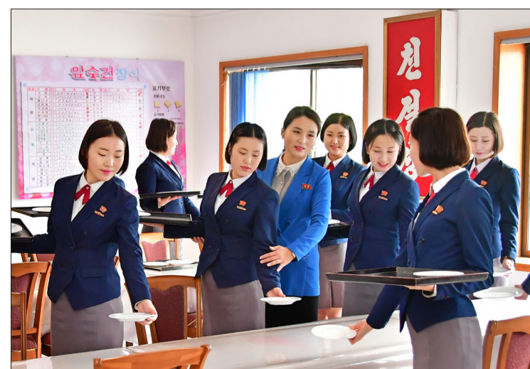
Students acquire professional knowledge through practical training at Pyongyang Jang Chol Gu University of Commerce.

Besides, it constantly consolidates its own material foundations including sanatorium and livestock and fish farms.