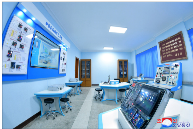
Rooms at the newly-built integrated experimental education hall. It is greatly conducive to the education and scientific research of lecturers and researchers and study of students.