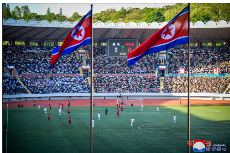
The finals of the Sports Contest of Workers in Major Industrial Sectors-2024 are held at Kim Il Sung Stadium.