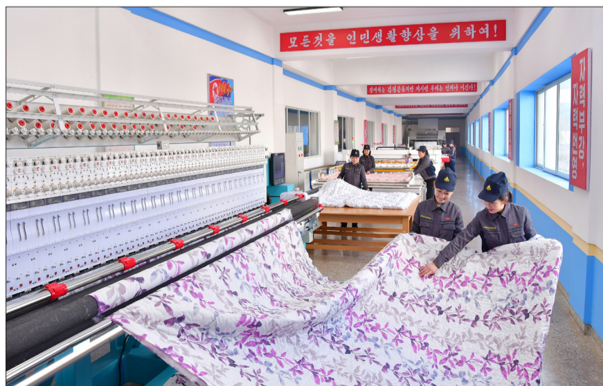
Workers produce quilts with plastic waste as a raw material at the Ponghwa Polyester Fibre Factory.

It is now putting efforts into raising the quality of its products so that they are favoured by people.