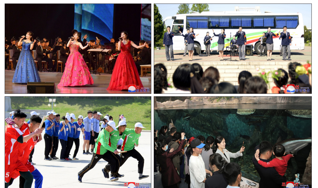
Working people enjoy themselves on the holiday across the country.

Kim Chaek Iron and Steel Complex, the Munphyong Smeltery, the Sinuiju Textile Mill and the Paeksok Farm in Sinchon County, adding to the joy of the working people. Colourful performances were given at theatres and outdoor stages in the capital city of Pyongyang and other parts of the country, revving up the atmosphere of the holiday. Public catering establishments across the country were crowded with visitors, and the cultural recreation grounds in Pyongyang including the Central Zoo, the Natural History Museum and the Munsu Water Park resounded with happy laughter of the working people.