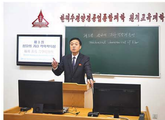
At an online-college lecture.

tention to making teaching plans for the students of the online college, and implementing the curriculum. Later it grasped an important matter in the education. Among the students were both university graduates and those of senior middle schools. Their enthusiasm for study was great, and they wanted to know a lot of things. They were deeply