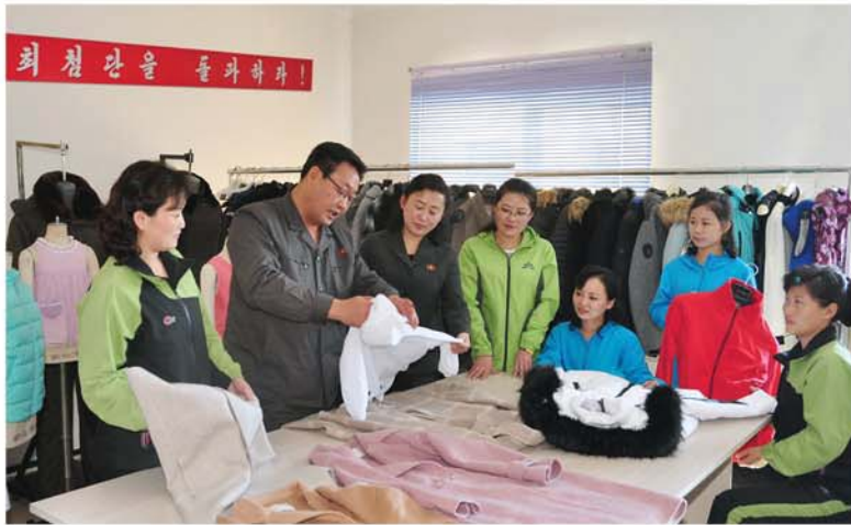
Attention is paid to the development of new products.

T HERE IS A BULKY BOOK in the Munsu Ponghwa Clothing Factory. It is a register of scientific and technical achievements that the factory has made recently. It tells a story.