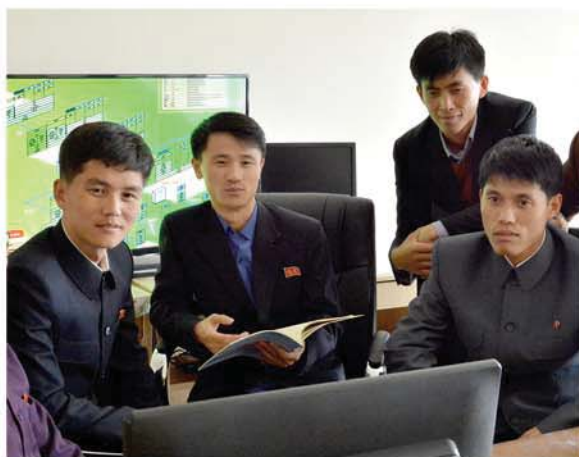
Developers of the IPTV service system.

The IP network gives IP addresses to particular terminals and provides information according to the protocol. The protocol is simple and practical compared with other protocols, so its use is a global trend today. An integration of all communications including telephone network, TV network and computer network on the basis of the protocol is just an all IP system.