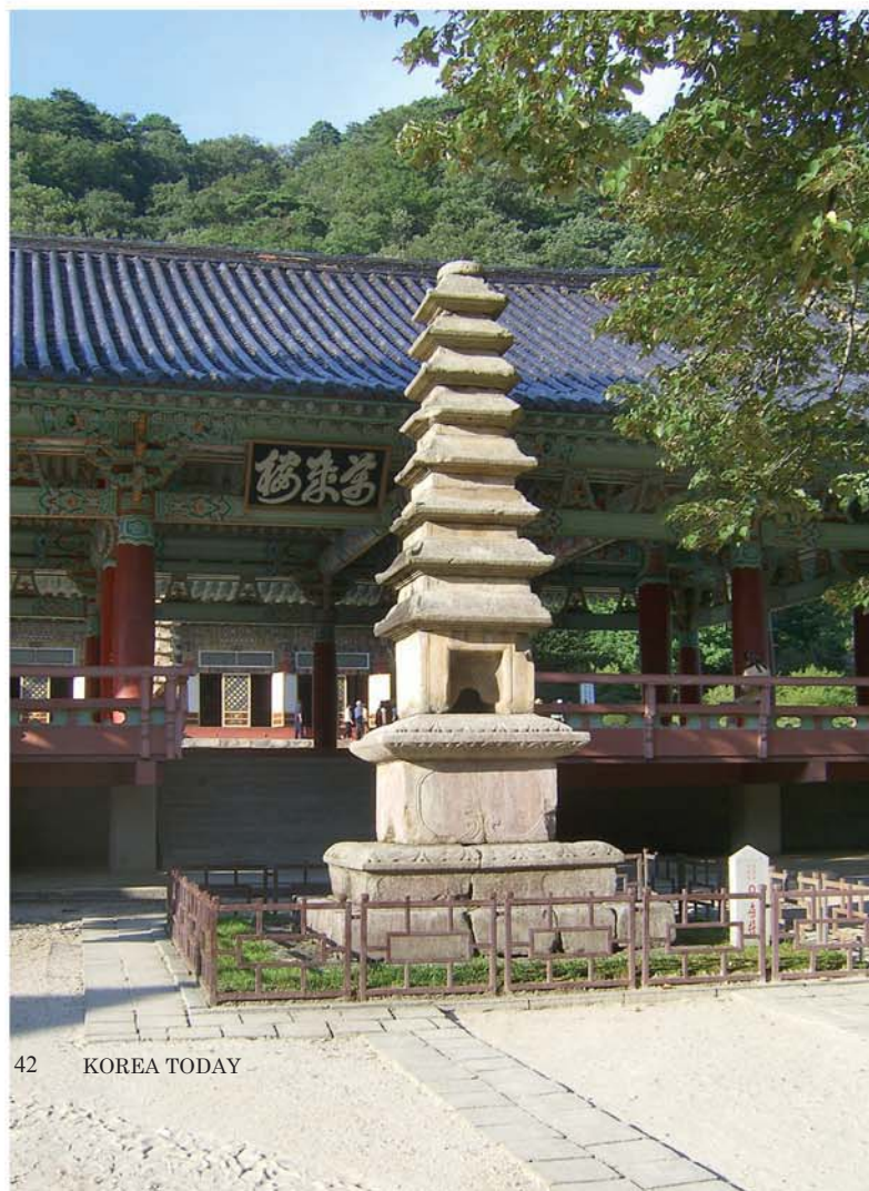
A 9-storey quadrangular pagoda of Pohyon Temple in Mt Myohyang.

The 13-storeyed octagonal pagoda was built in the late Koryo dynasty (918-1392). The structure of well-trimmed granite pieces is 8.58 metres high with its 6.58 metres high body. The length of each side of the octagonal pedestal is 1.2 metres. The pagoda retains peculiarities of the late Koryo dynasty in all aspects.