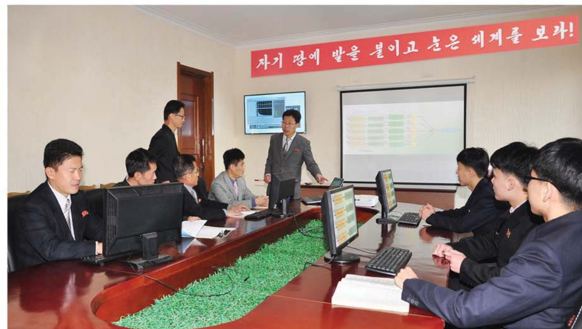
Experience presentation takes place on a regular basis.