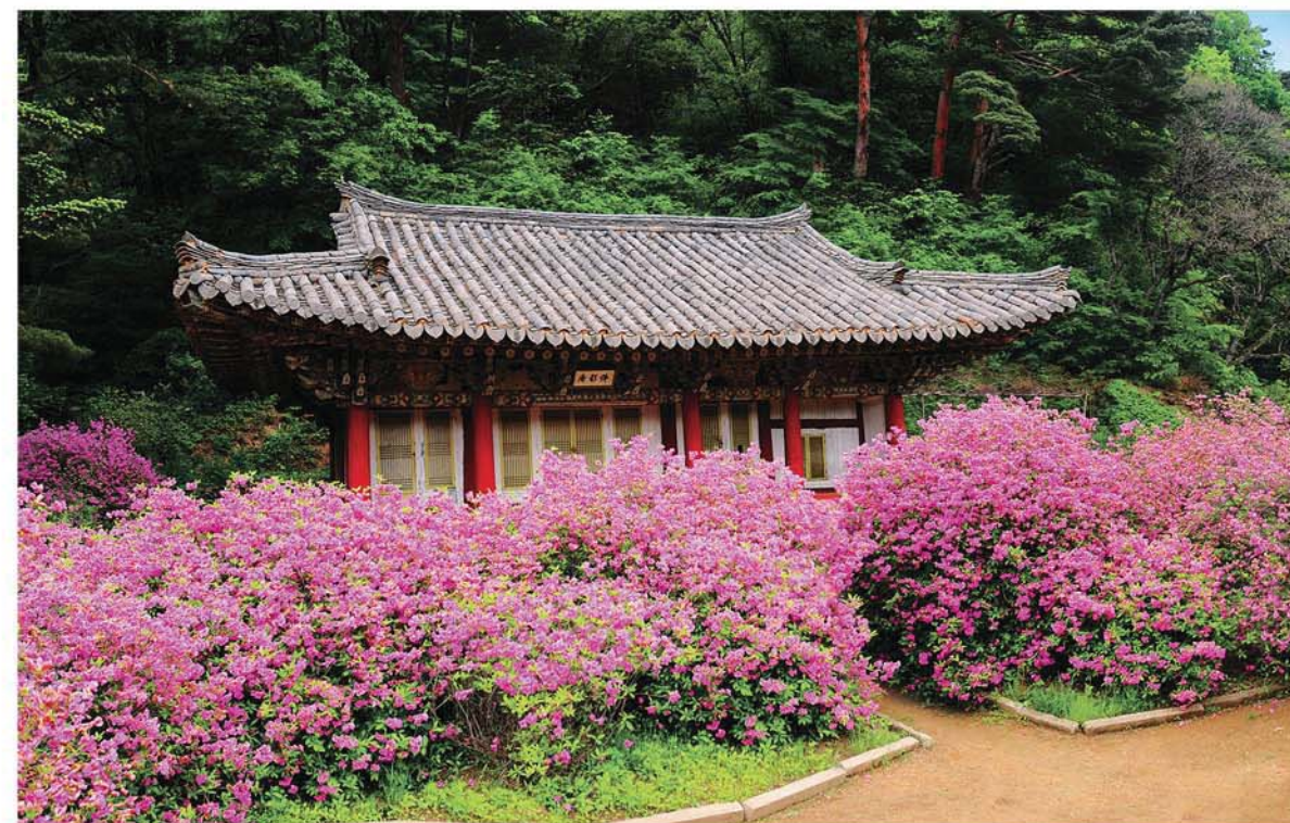
A group of hundreds-of-years-old Rhododendron yedoense in the yard of Pulyong Hermitage.