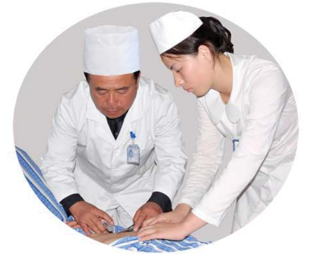
Ozone therapy is applied.

With this as an opportunity he redoubled his efforts. And other doctors of the hospital spared no time helping him to acquire data needed for his research. At that time there were not enough data on the ozone therapy. It was very difficult