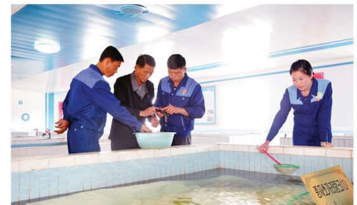
Conditions of fish are observed.