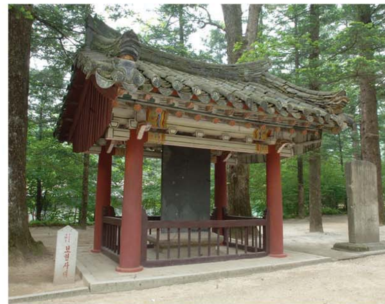
The monument to Pohyon Temple.

There are lots of living monuments in Mt Myohyang. The Myohyangsan Mulberry besides the Chonwang Gate in Pohyon Temple, the biggest and oldest of its kind in Korea, is over 400 years old. A group of Rhododendron yedoense growing in the yard of Pulyong Hermitage for hundreds years, have red flowers in full bloom between April and May. A Myohyangsan ash tree stands on the bank of the Myohyang Stream in the front of the temple. The Sangwonam Gingko Tree stands in the garden of Sangwon Hermitage. The trunk and bark of the Myohyangsan Pine Tree are typically red. And others are squirrel, Ryongyon Waterfalls