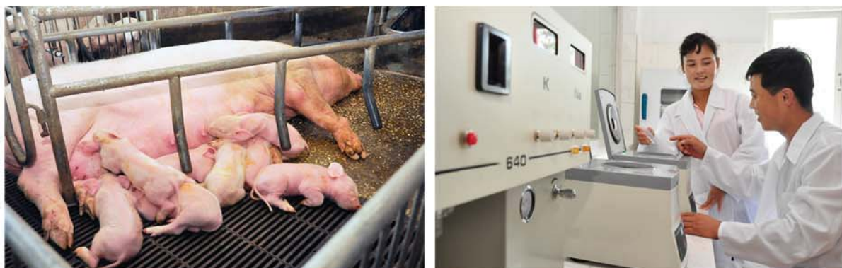
Efforts are made to put the production of choice breeding pigs on a scientific basis.