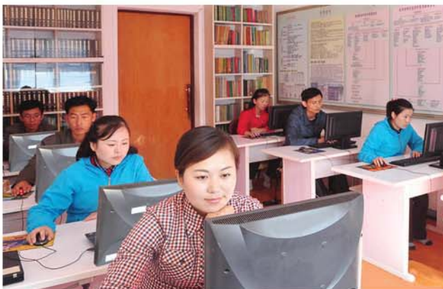
Normal operation is ensured by improving the technical knowledge and skills of the workers.