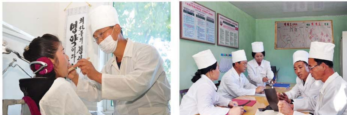
Doctors look after patients with utmost sincerity.