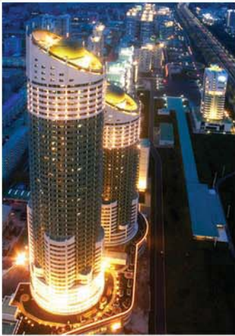
Back Cover: Ryomyong Street at night