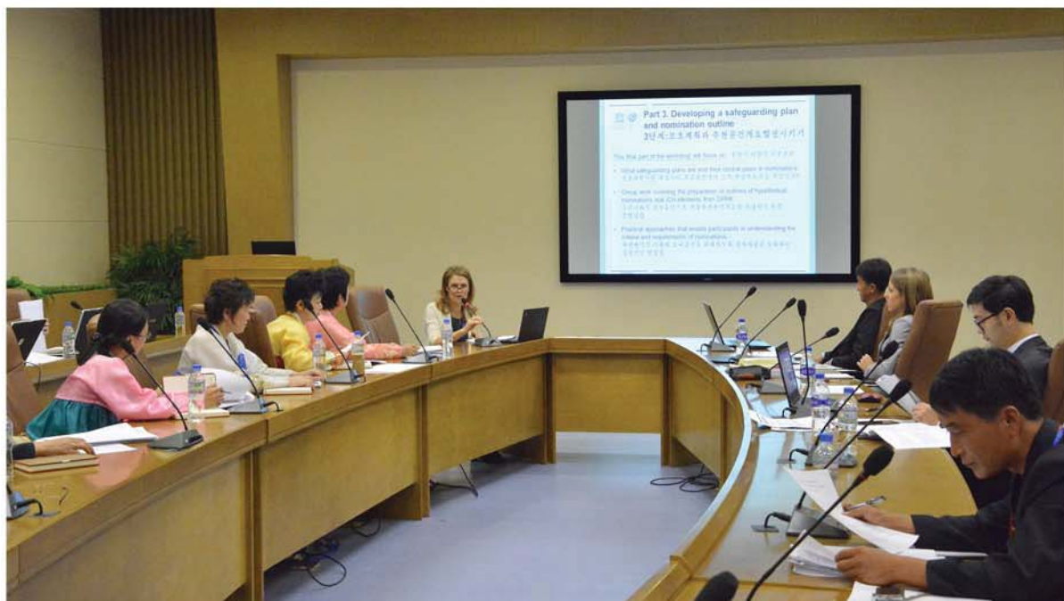
A scene from a UNESCO training workshop on preservation of intangible cultural heritage.