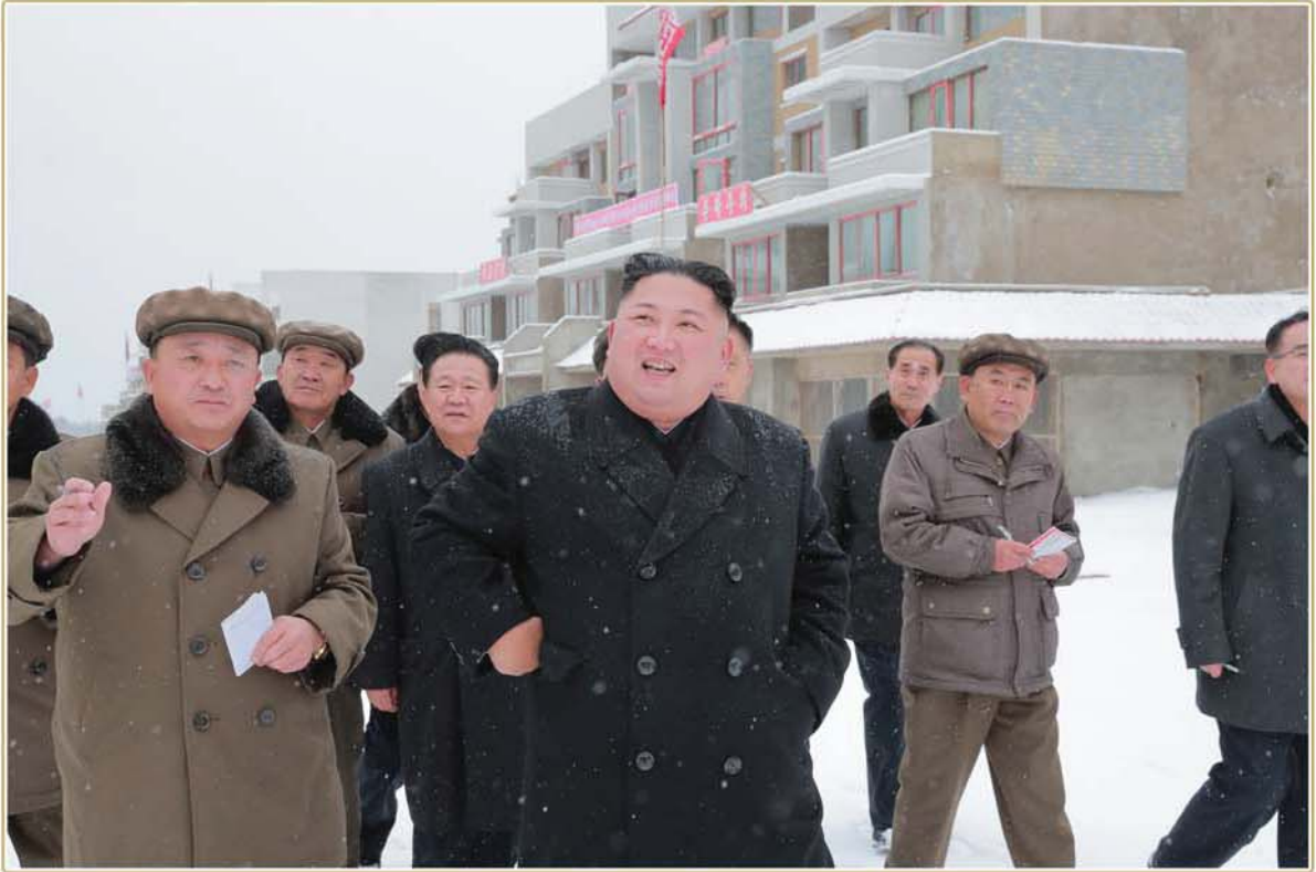
Supreme Leader Kim Jong Un inspects Samjiyon County in October 2018.