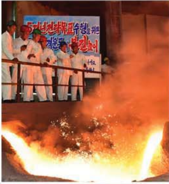
Front Cover: Innovations occur at the Kim Chaek Iron and Steel Complex